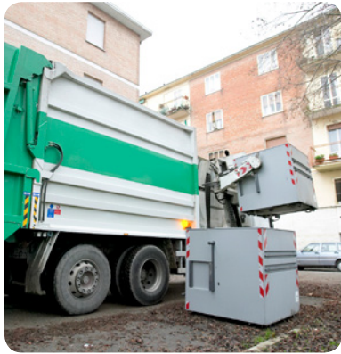
HID can create a custom tag solution to fit your application requirements for chip type, dimensions, programming and materials.