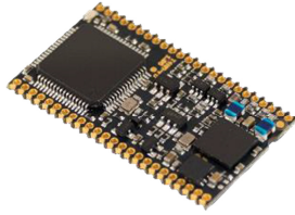
Version C0 (SMT) 31 x 17.8 x 2.7 mm